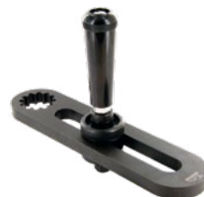
Sliding Reaction Plate