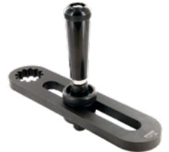
Sliding Reaction Plate