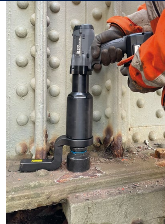
Untightening corroded bolts for construction industry.

A variety of reaction bars and brackets is available, but in case of a need for a tailor made reaction bar, it is possible to share the 3D CAD drawings.